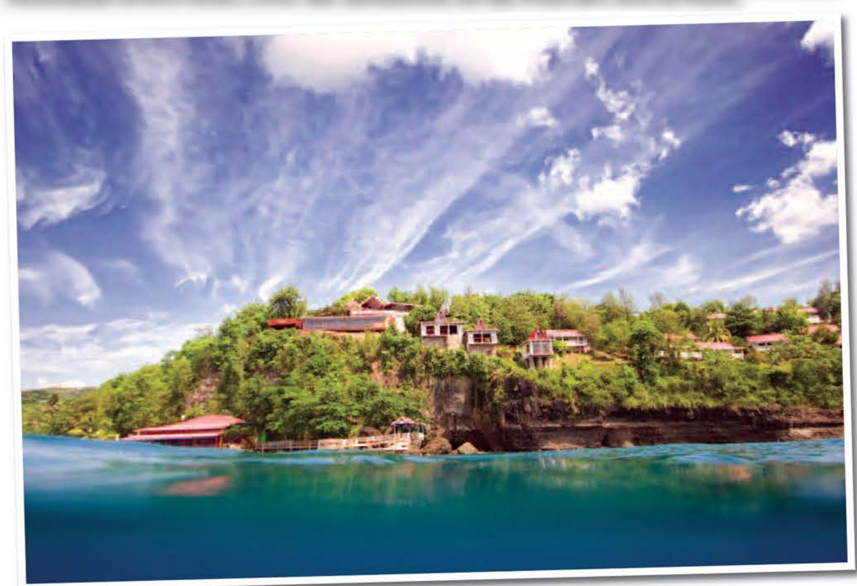
Be inspired by the gorgeous surroundings of Ti Kaye resort in St Lucia and try coconut painting.